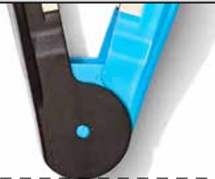
Staple Remover: _____