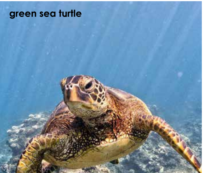
green sea turtle