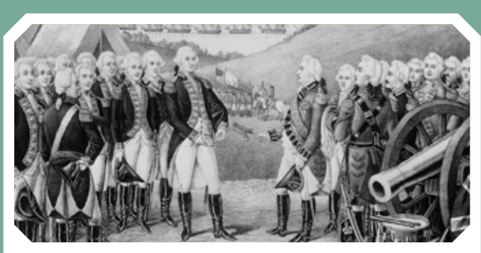
The British surrendered at Yorktown