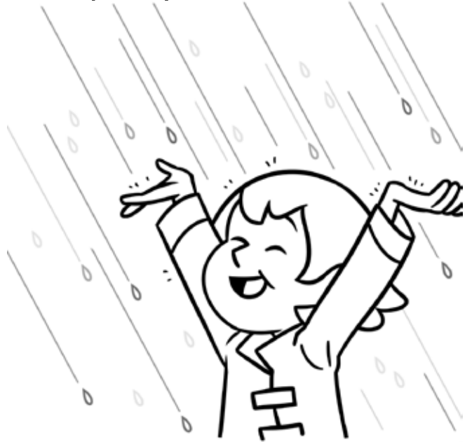
rain _____ ----- _____